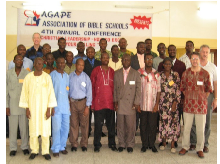
Conference Speakers and CBBS Directors

Our 2007 conference featured some powerful preaching and teaching by three mighty men of God.